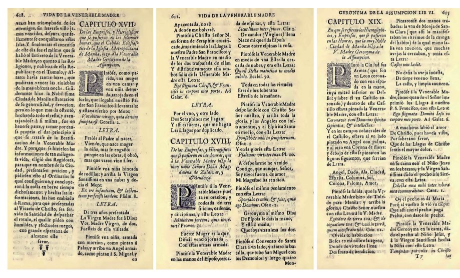
Figure 3. Chapters that contain emblems dedicated to Mother Jerónima's funeral, Ginés de Quesada, Exemplo de todas las virtudes... (Mexico: por la viuda de Miguel de Ribera, 1713), 618, 622, 625.