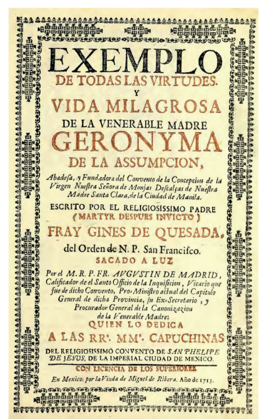
Figures 1 and 2. Cover pages of Bartholomé de Letona, Perfecta Religiosa... (Puebla: por la viuda de Juan de Borja, 1662) [left] and Ginés de Quesada, Exemplo de todas las virtudes... (Mexico: por la viuda de Miguel de Ribera, 1713) [right].