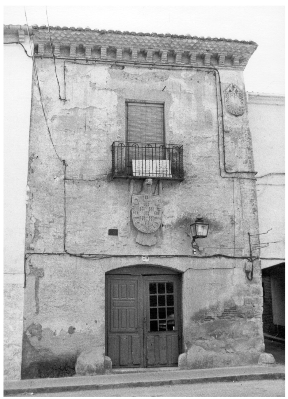
Figure 2. Eagle House